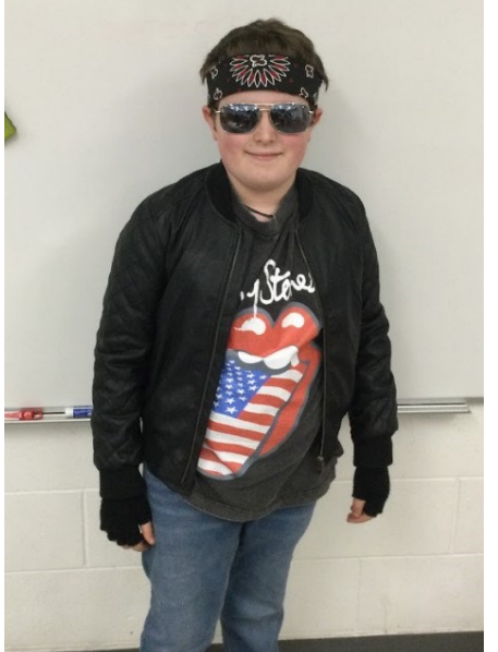
Grade 5 Science Fair